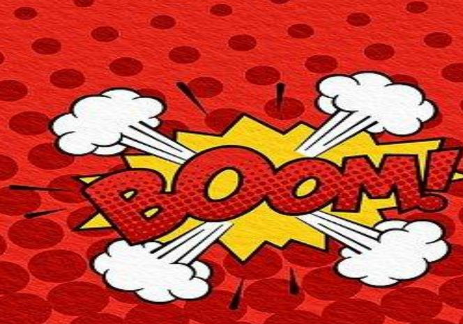
Our Superpig jet packs!

Look at our superhero masks and cuffs, ready for our Superhero day on the last of term!