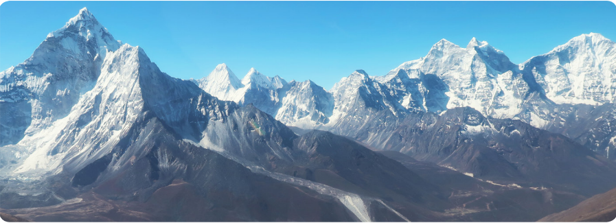
Himalayas mountain range

A mountain is a large, raised part of the Earth’s surface. A mountain’s highest point is called its peak or summit. Mountains are at least 610m in height. A mountain range is a chain of mountains that are close together. They are usually arranged in a line connected by ridges.